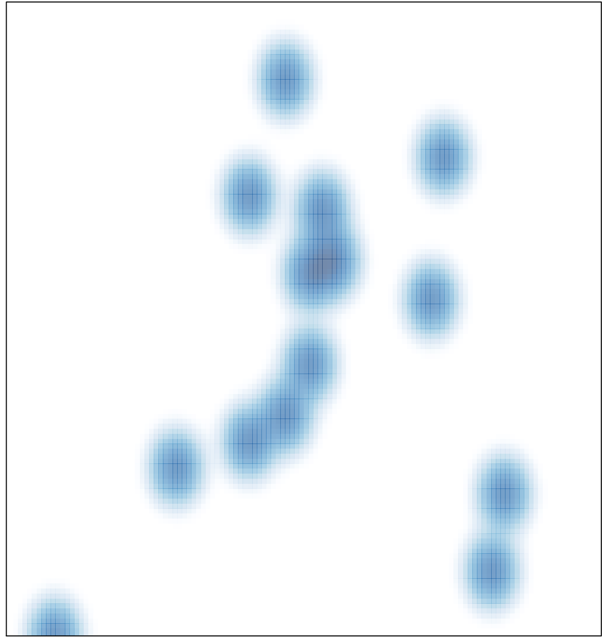
# features = 16 , max = 1